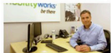
Certified Mobility Consultants Provide Comprehensive Needs Analysis

MobilityWorks is committed to serving you. Contact us today so we can evaluate your needs and find a solution that best fits your lifestyle.