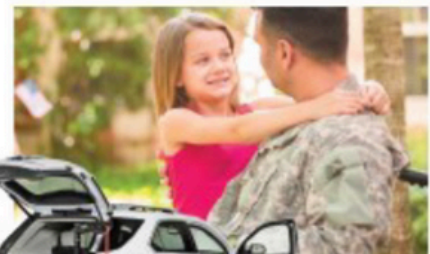
Scooter lifts, turning seats, and driving accessories

Akron 810 Moe Dr. Akron, OH 44310 330-247-6295