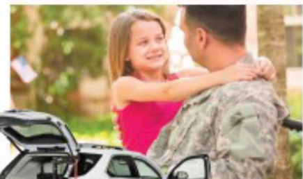
Scooter lifts, turning seats, and driving accessories