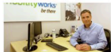
Certified Mobility Consultants Provide Comprehensive Needs Analysis

MobilityWorks is committed to serving you. Contact us today so we can evaluate your needs and find a solution that best fits your lifestyle.